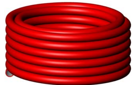
POKAPOSTE SEMI-RIGID HOSE