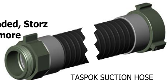
TASPOK SUCTION HOSE