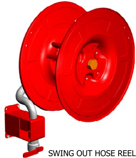
SWING OUT HOSE REEL FOR SEMI-RIGID HOSE