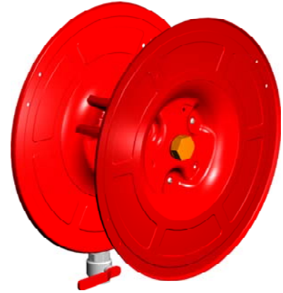
STATIONARY HOSE REEL FOR SEMI-RIGID HOSE