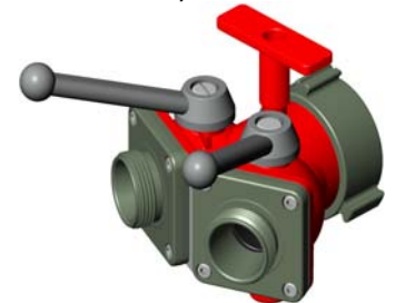
BIPOK 2.5" NST / 2x1.5" NST