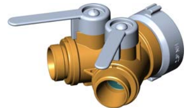
BIPOK in Bronze NSN 4210-00-255-0234 2.5" NST / 2x1.5" NPSH