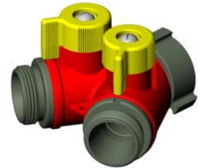
BIPOK WILDLAND 1.5" NST / 2x1.5" NST short handle