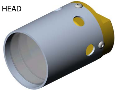
DISCHARGE HEAD 5 GPM