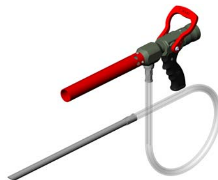
LOW EXPANSION FOAM NOZZLE with pick-up tube