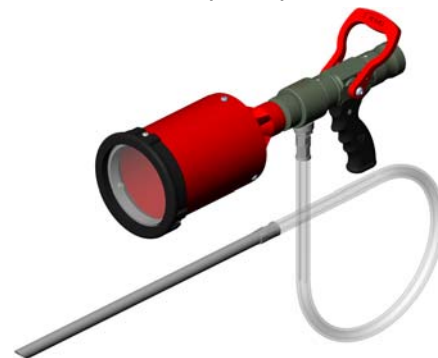
MEDIUM EXPANSION FOAM NOZZLE with pick-up tube