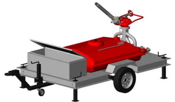
Monitor with tank 135 gal / 500 lit.