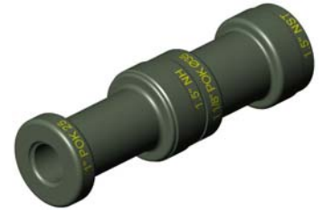
DUAL STACKED TIPS