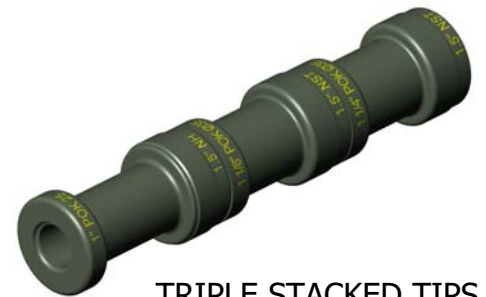
TRIPLE STACKED TIPS