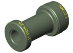
SINGLE SMOOTH BORE