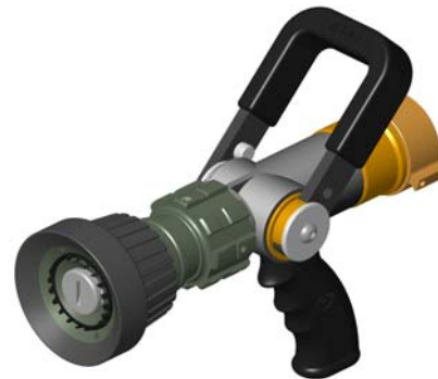
TURBOKADOR 500 DHT Electrical Fire Stainless Steel and Aluminum