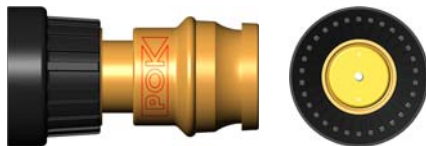
Petroleum Cargo Ship Nozzle Made of bronze and stainless steel. Weight: 2.8 KG / 6.2 lb