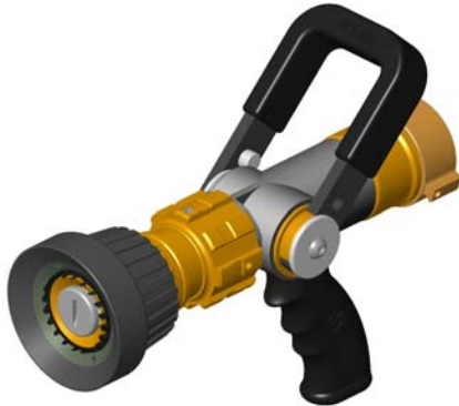
TURBOKADOR 500 DHT Electrical Fire Stainless and Bronze

Durable, lightweight, rugged cast and machined in stainless steel or bronze. Wide range flow capacity from 30 to 125 GPM. Available in 1.0", 1.5" and 2.5" ball bearing female swivel with machined strainer/stream shaper, stainless steel ball or brass valve, anti-static, shockproof and thermo-insulated elastomer pistol grip and bumper guard. Stainless steel nozzles dielectric tested at 20,000 volts in conformance with NF S61 820. (If purchased for the use of electrical fires (DHT), the flush and straight stream flow are eliminated). Comes standard with a black pistol grip and bumper guard. Color coded pistol grip and bumper guard and air apirating foam attachment available.